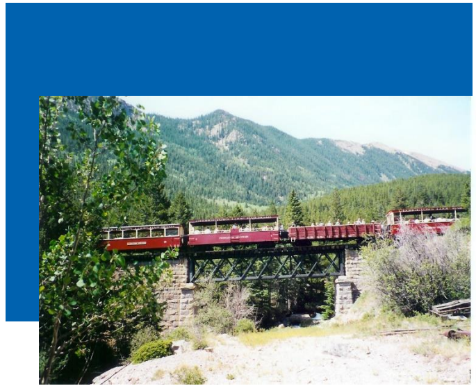
Georgetown Loop Railroad