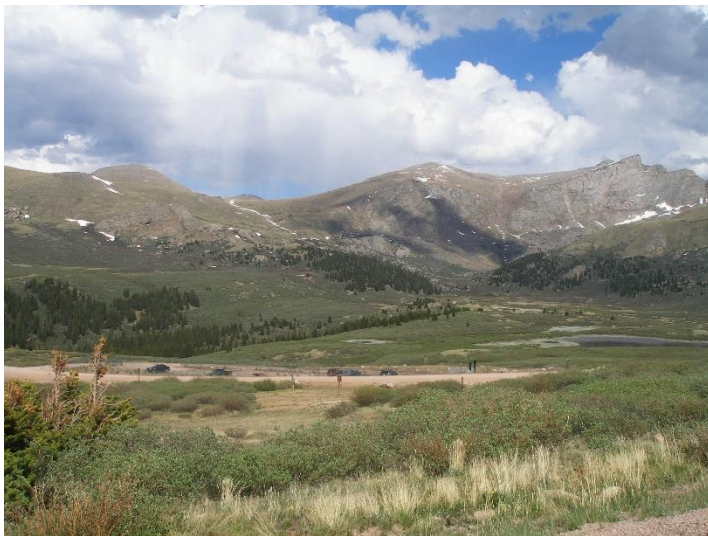
Mount Bierstadt from summit