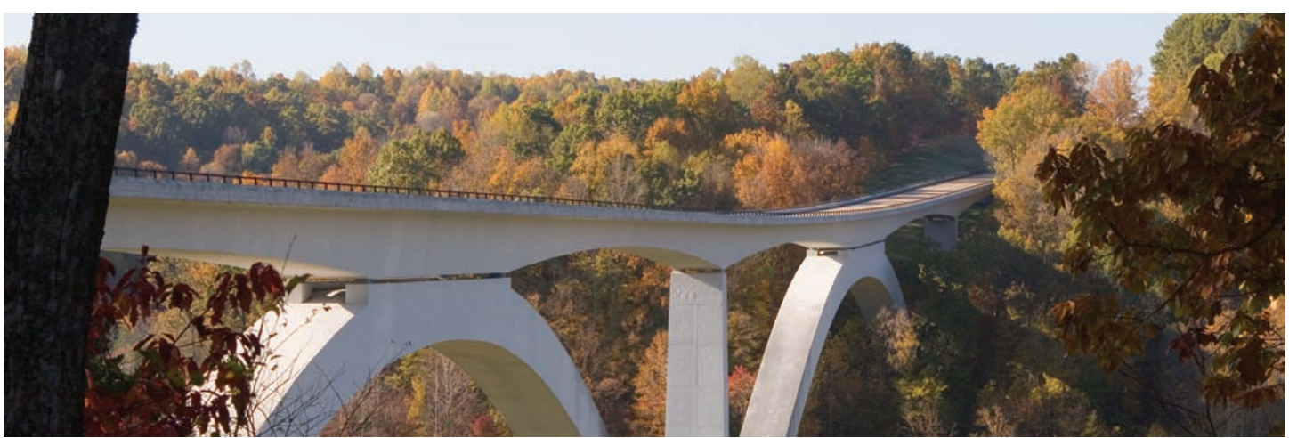
Nearing NASHVILLE is the architecturally stunning double arch bridge separating the Parkway and Tennessee Highway 96. Shortly past there is the northern terminus of the Parkway and access to Interstate Highway 40 and all that Tennessee's capital city of Nashville has to offer.

866.253.9207 • www.visitwilliamson.com • Franklin